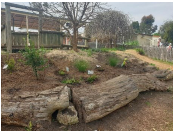
The new native garden