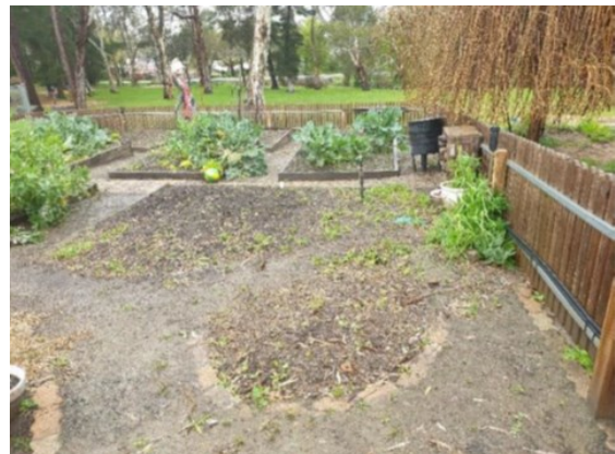
Proposed spot for the wicking beds

Our Special Person day was a big success, even though our helpers were enlisted to get their hands very gooey making papier mache planets with the children. All of the adults got stuck in and now we are able to paint each planet for a display for the Library for the anniversary of the Space Mission.