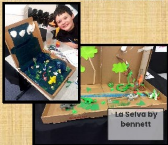
La Selva by bennett

'El mar means 'the sea'. My habitat has turtles, a baby shark, 6 piranhas, coral and shells.'